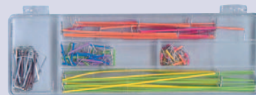
MB-900 140 pc Kit