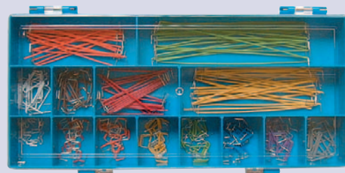
MB-910 350 pc Kit